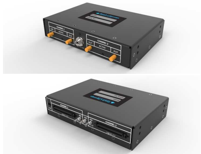
Front and rear view

The 6000 Driver is available in three frequency bands, and each unit includes a monitor output that covers the entire 20-450 MHz frequency band. Driver functionality can be re-configured over the USB interface.